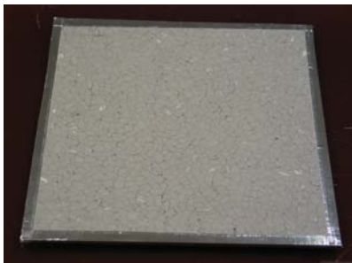
Table 8. Pictures of The Tested Specimen