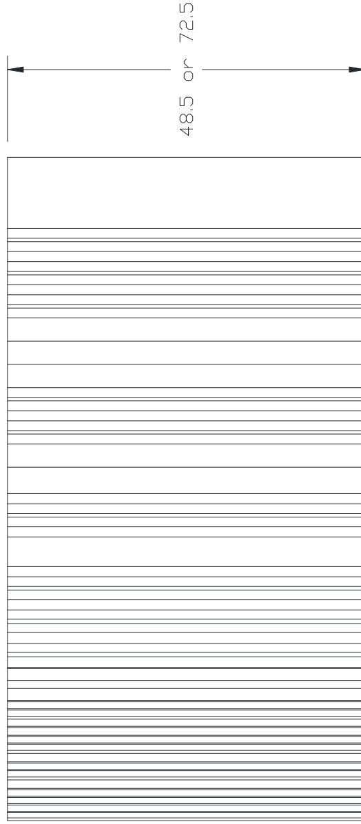
Smart Step Stair Tread 12" Vinyl Round Nose